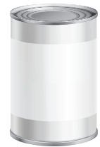
ALUMINUM, TIN & STEEL CANS