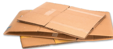
FLATTENED CORRUGATED CARDBOARD