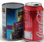
ALUMINUM & STEEL CANS

EMPTY AND RINSE CONTAINERS • NO TRASH OR YARD WASTE • NO PLASTIC BAGS