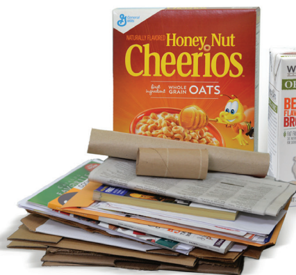
ALL PAPER & CARDBOARD PLEASE FLATTEN ALL BOXES