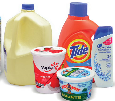
PLASTIC BOTTLES, JUGS, TUBS